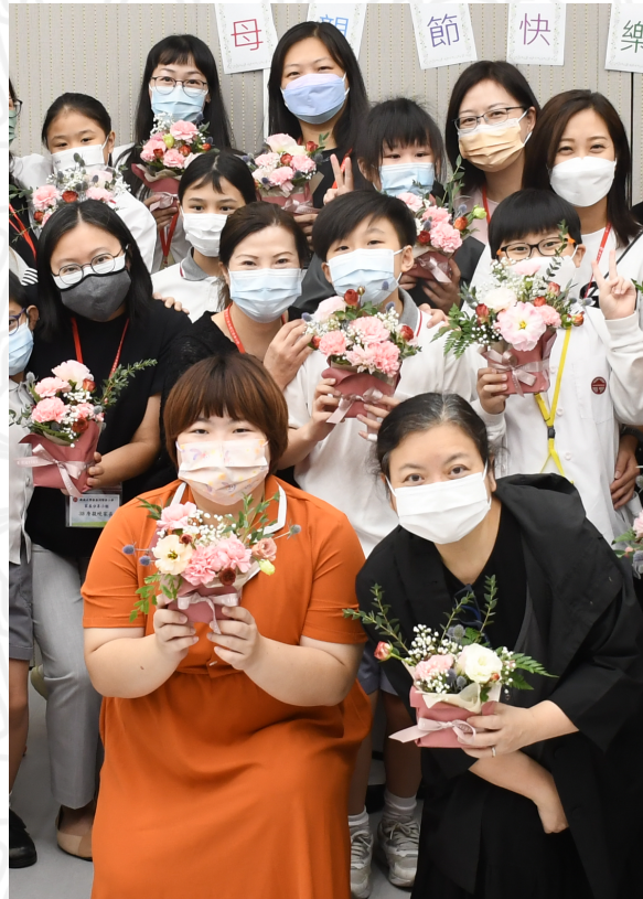
by Bubu Chan

On 25th May it was Character Day! All teachers and students dressed as their favourite characters. This year, there were a lot of different characters from a variety of different books. We saw lots of superheroes, wizards and princesses. Did you dress up for Character day? What did you dress as?